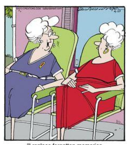
"I replace forgotten memories with stuff I make up."

Next week on Saturday May 6 we expect to see everyone working on the Pancake Breakfast. The signup sheet is still circulating. Don't forget, it will be held at the American Legion this year! Corner of 1<sup>st</sup> Ave NW and Civic Center.