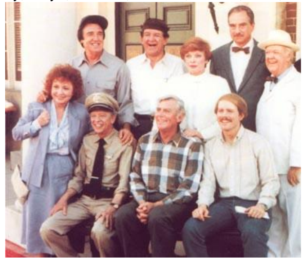
Earnest T Bass, Helen, Thelma Lou, Clara and, of course, Opie were all single. The only married person was Otis, and he stayed drunk.